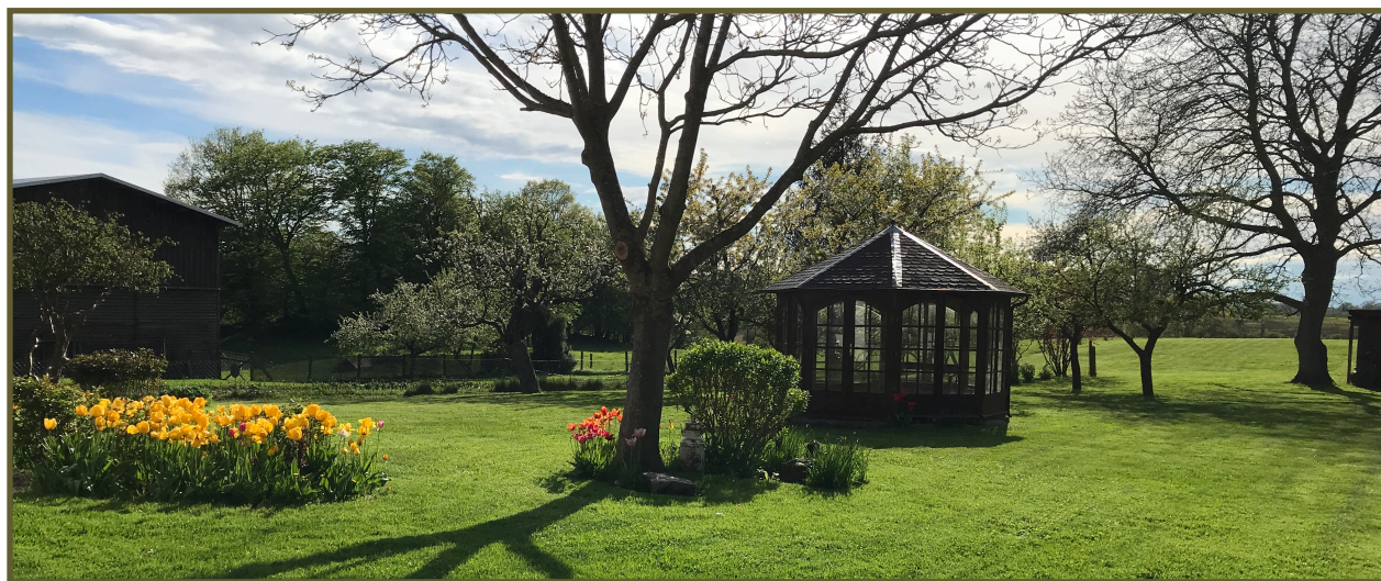
Pink Door Country

Seven years of perpetual motion continue at Pink Door. We're moving our office location to central Berlin in order to better resource our team and clients. The pandemic necessitated that we accelerate our community-based care and that focus has opened up a whole new world of possibilities for us. Throughout the pandemic, our team has worked at 100% capacity, which has enabled us to expand our team and ministry of healing, restoration and reconciliation.